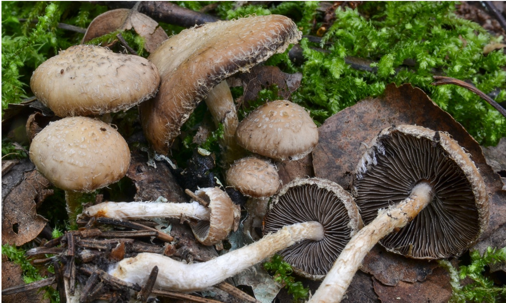
Récolte du 16/06/2018 sur la même station Tourbière de Frasne, en pessière, sur débris ligneux.